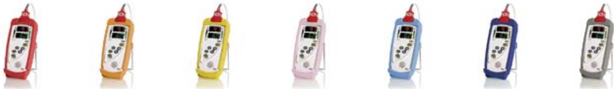
Protective boots are available in your choice of seven different colors.